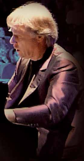
RICHARD CLAYDERMAN AP 275

On this October the 20 th of 2015, it has been a great pleasure for me to perform on this ANT. Petrof Grand Piano for a full house audience at the Prague Congress Hall.