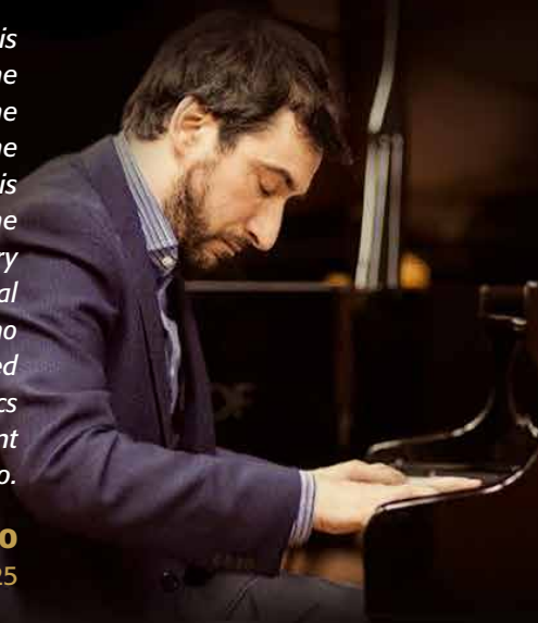
ANTONIO FORMARO AP 225

It has a beautiful design, great mechanics and amazingly colourful tones with a diverse dynamic range. Its sound characteristics are close to a smaller grand. It's an instrument of high quality and it can be compared with world-class instruments. This instrument deserves 5 stars out of 4.